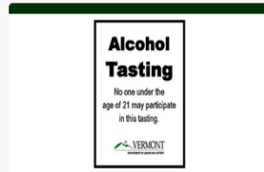
MANDATORY Must be displayed at Retail Tasting Events