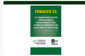
MANDATORY Must be displayed by all businesses that hold a Tobacco License