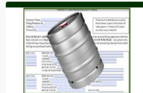
MANDATORY Kegs must be logged on this form whenever a keg is purchased