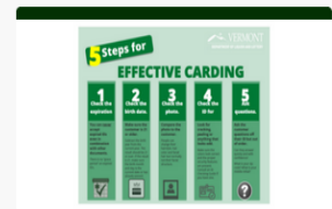
EFFECTIVE CARDING POSTER 6 steps for effective carding

Check out our website at liquorcontrol.vermont.gov for the licensing portal and for all your education needs!