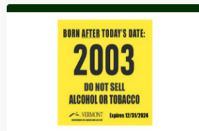
ALCOHOL AND TOBACCO YEARS STICKER Can help you determine if a person is old enough to purchase alcohol or tobacco