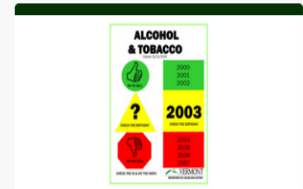
ALCOHOL AND TOBACCO STOPLIGHT POSTER Can help you determine if a person is old enough to purchase alcohol or tobacco