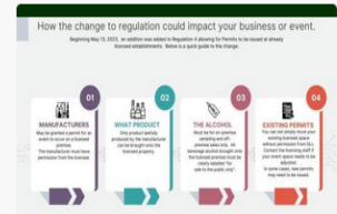
REGULATION UPDATES #4 2023 Regulation Updates #4 2023