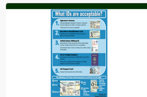
ACCEPTABLE IDS POSTER Reminds everyone which forms of ID are acceptable in Vermont