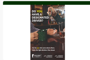
MANDATORY Must be displayed by all businesses serving alcohol

Below are mandatory posters, optional posters and other publications that may be helpful for your business. Click on the image to open the PDF to print. To request a printed copy be mailed to your business email DLL.DLCEduTeam@vermont.gov .