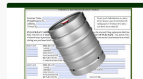
MANDATORY Kegs must be logged on this form whenever a keg is purchased