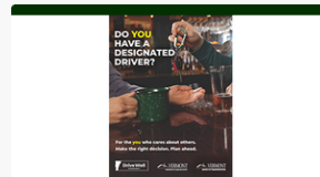
MANDATORY Must be displayed by all businesses serving alcohol

Below are mandatory posters, optional posters and other publications that may be helpful for your business. Click on the image to open the PDF to print. To request a printed copy be mailed to your business email DLL.DLCEduTeam@vermont.gov .