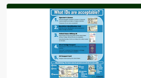
ACCEPTABLE IDS POSTER Reminds everyone which forms of ID are acceptable in Vermont