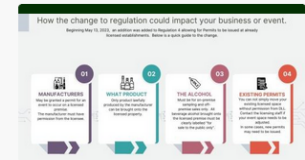
REGULATION UPDATES #4 2023 Regulation Updates #4 2023