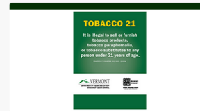
MANDATORY Must be displayed by all businesses that hold a Tobacco License