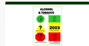
ALCOHOL AND TOBACCO STOPLIGHT POSTER Can help you determine if a person is old enough to purchase alcohol or tobacco