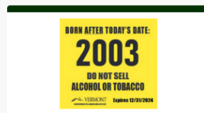
ALCOHOL AND TOBACCO YEARS STICKER Can help you determine if a person is old enough to purchase alcohol or tobacco