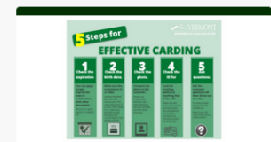
EFFECTIVE CARDING POSTER 6 steps for effective carding

Check out our website at liquorcontrol.vermont.gov for the licensing portal and for all your education needs!