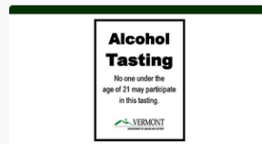
MANDATORY Must be displayed at Retail Tasting Events