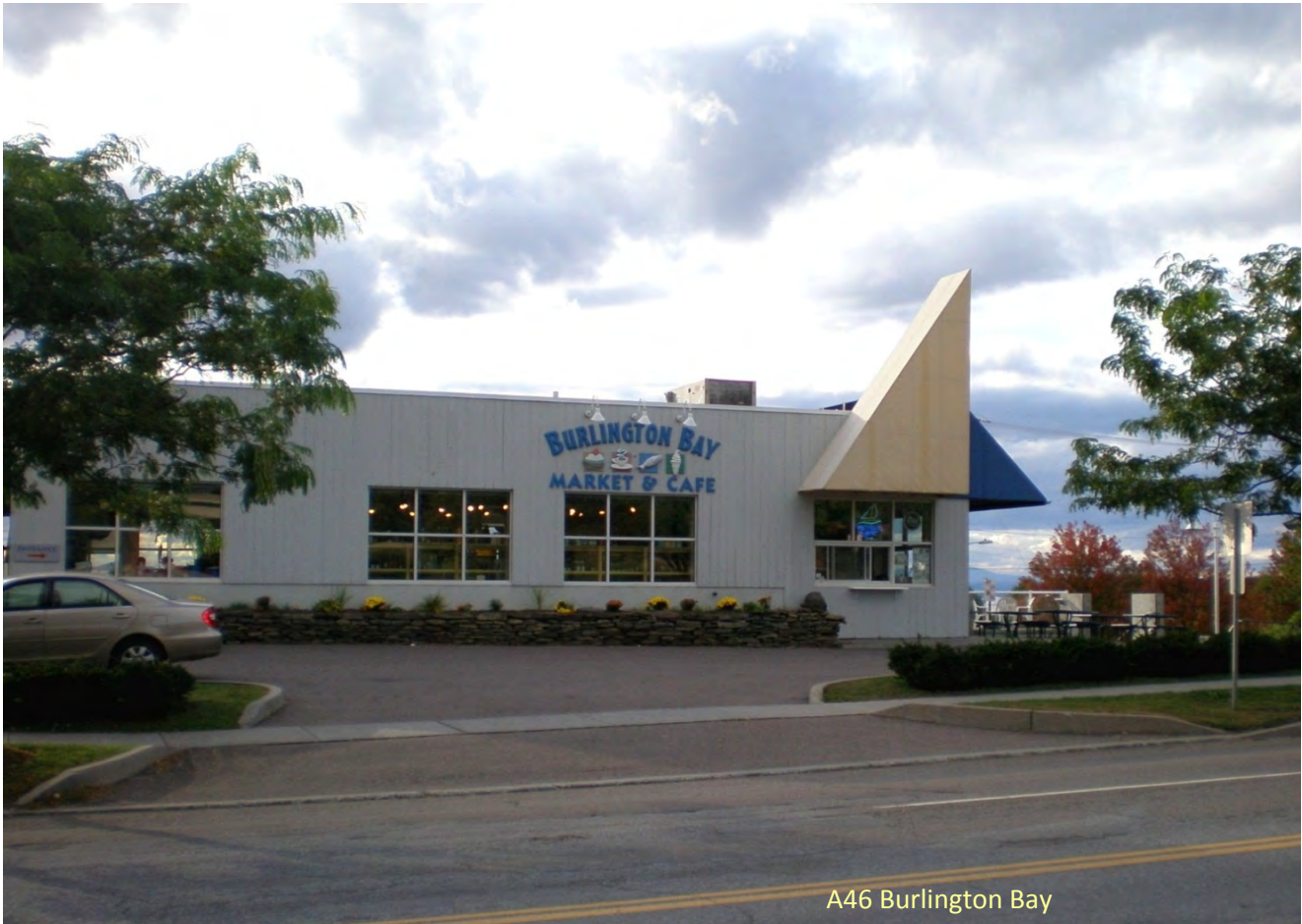
A46 Burlington Bay